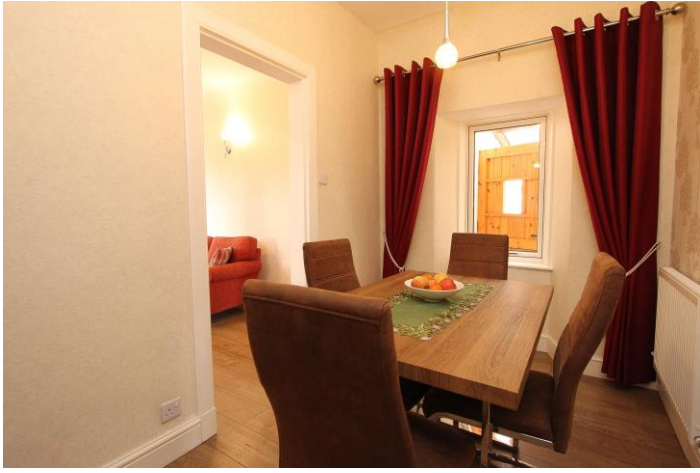
KITCHEN: (Approx 2.5m – 4m)

The kitchen has been fitted with a range of oak design floor and wall mounted units with solid granite worktops incorporating a double Belfast sink with swan neck mixer. There is an electric range style cooker, extractor hood. CH radiator.